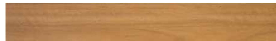
PENINSULA1164 Boneo Blackbutt