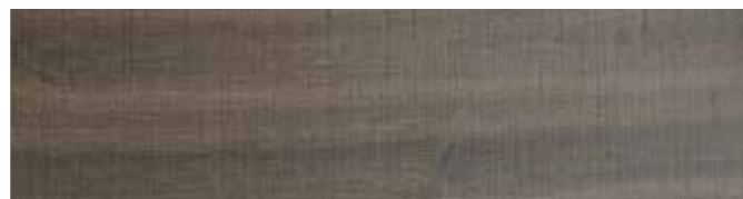
WHITSUNDAYS1141 Brampton Oak