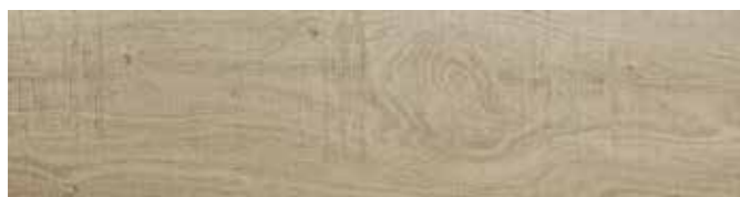
WHITSUNDAYS1143 Long Island Oak