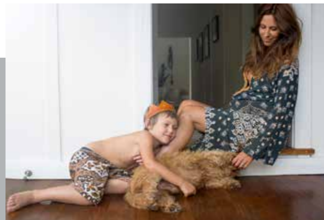
Jacana Spotted Gum

AquaPlank™ is extra hard wearing Clear, enhanced UV cured coating - scratch resistant - stain resistant - burn resistant - anti-bacterial