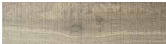
WHITSUNDAYS1144 Hayman Oak