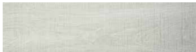
WHITSUNDAYS1146 Whitehaven Oak