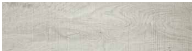
WHITSUNDAYS1147 Daydream Oak