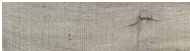
WHITSUNDAYS1140 Hamilton Oak