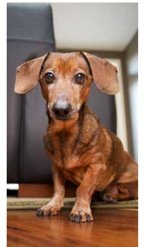
Dromana Spotted Gum