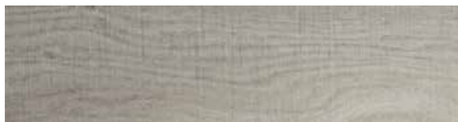
WHITSUNDAYS1145 Airlie Oak