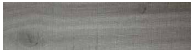
WHITSUNDAYS1148 Lindeman Oak